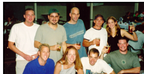
The gang's all here....

On August 25 th a group of young ANCM swimmers made the annual trek to Stoudts Brewery in Pennsylvania. After spending the day speaking German, dancing the Russian Waltz, winning the mug-holding contest and telling stories of yesteryears' glorious swim races, the group of nine went to the local camp site and roughed it for the night in their tents. It was a blast!